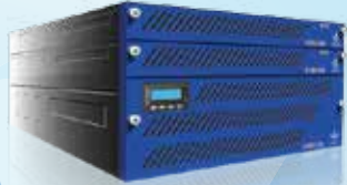
HA Node (High Availability)