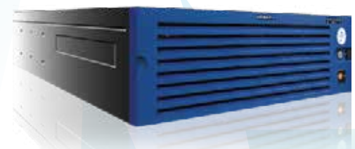
StoneFly DR365V™ appliance